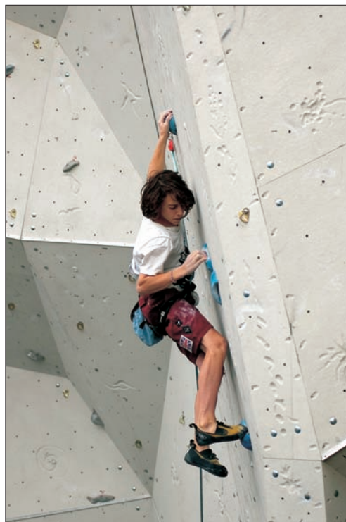
An indoor climbing competition