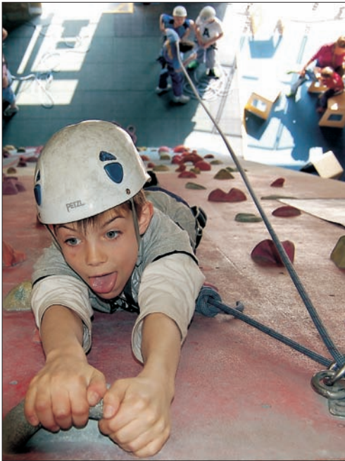
Top-roping at in indoor wall

Additionally, children are particularly vulnerable to overuse injuries during growth spurts. During periods of rapid growth, high intensity activities should be avoided. Overenthusiastic children who have unsupervised access to training facilities (including training boards in garages, cellars and bedrooms) can develop overuse injuries. Parents need to be aware if their children are using such facilities and act accordingly to prevent injuries. For more information on this issue see the Youth and Equity pages of the BMC website.