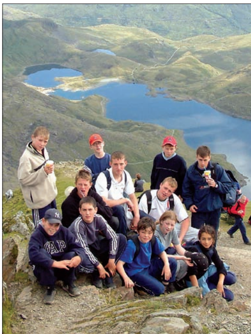
Hill walking has fabulous views

not to. That is their choice. As a parent, you will need to decide whether you want your child to wear one or not.