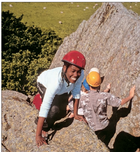
Bouldering outside

Some clubs accept under 18s, some don't and others will only accept them if accompanied by their parent(s) or legal guardian. There are 350 clubs in England and Wales listed by geographical area on the club finder on the BMC website. Again, it is worth attending a club meet to decide whether you would be happy to allow your child to participate in the club's activities.