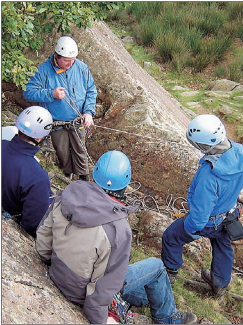
Learning skills

Many also advertise in the specialist climbing and hill walking magazines. These can be purchased at most major outdoor shops, newsagents, or at greatly reduced rates when taking out a subscription with BMC membership.