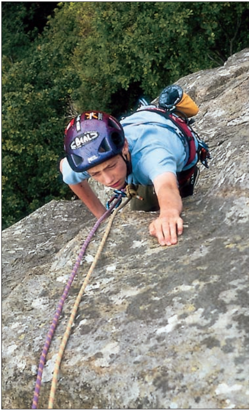
Climbing outside

Risks need to be put in context. There are currently about 5 million climbing wall user visits annually and it has been estimated that between the 1960s and 2008 there were approximately 50 million climbing wall user visits in the UK alone. During that period there was one fatality at a wall in England and Wales and that involved an adult. There are 13 million young people in this country. Approximately 700 have fatal accidents every year. Of these, 457 are land transport accidents (National Statistics). This compares with approximately one child death per year in organised adventurous activities.